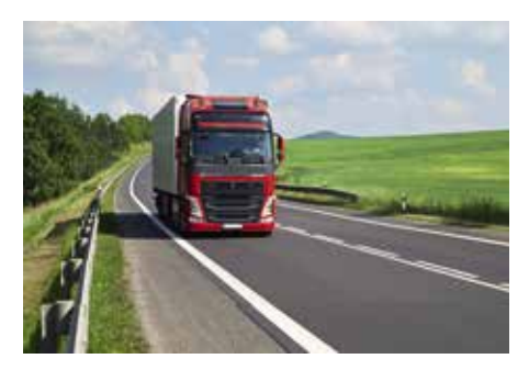
Transport to construction site (A4)