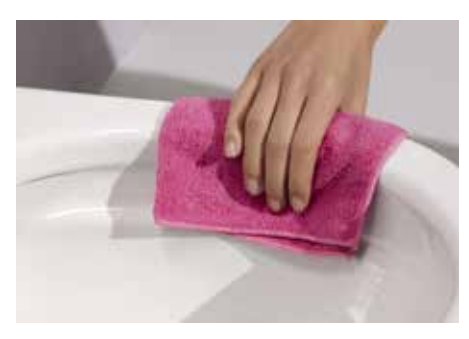
Cleaning to maintain the aesthetic quality of ceramics (B2)