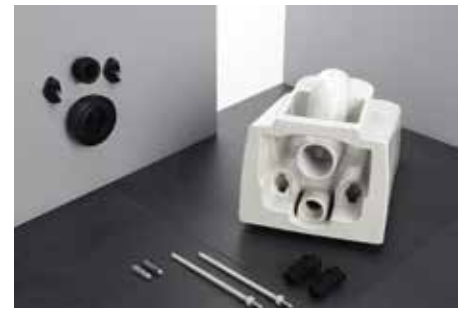
Installation in the building (A5))